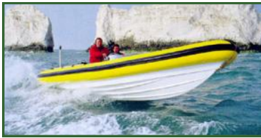
RIB Ride with Lochaber Watersports