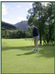
The Dragon's Tooth Golf Course

Discounted Green Fees for guests & club hire available.