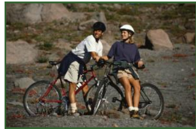
Mountain Bike Hire

a great way to explore the area helmet and toolkit provided Bike rack available on request full day £15/half day £10 Adjacent to The Isles of Glencoe Hotel